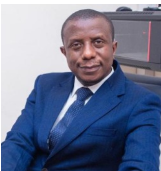
Umaru Koroma Deputy Minister of Justice, Sierra Leone