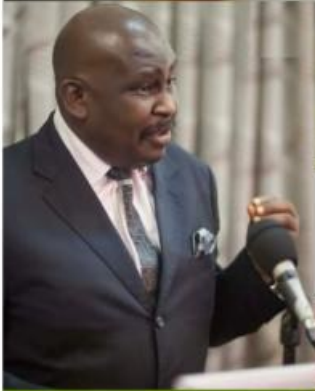
Hon. Justice Babatunde Edwards, Chief Justice of Sierra Leone