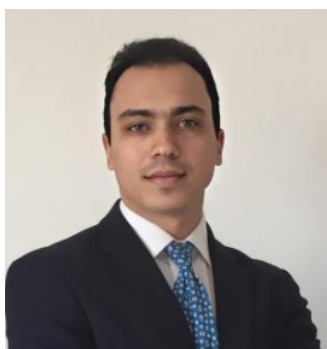
Mohamed Mostafa Ministerial Committee for Settlement of Investment Disputes, Cabinet of Egypt